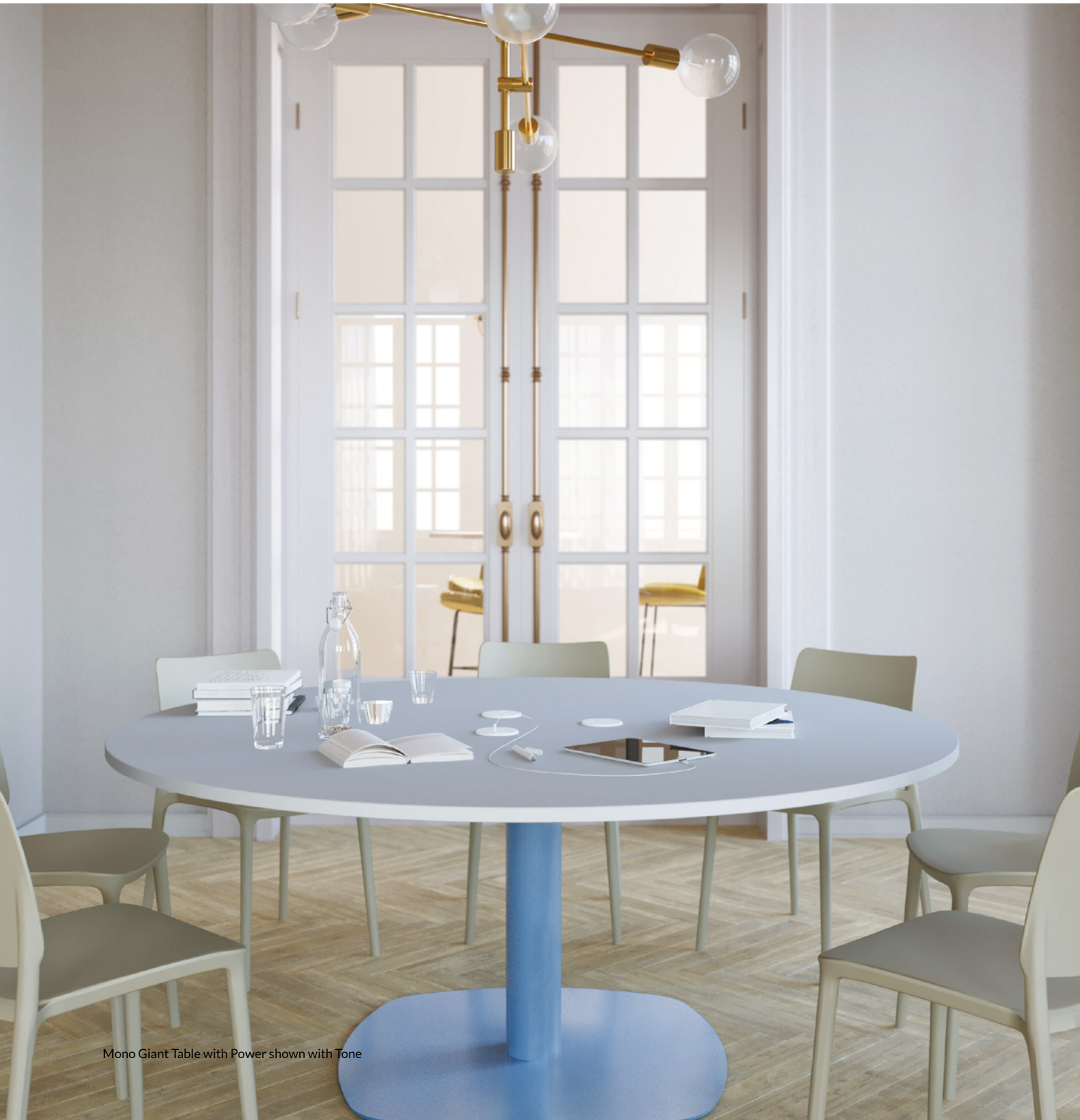
Mono Giant Table with Power shown with Tone

Exceptional capacity, suitable for up to 10 people. Round shape creates a positive, collaborative seating system, making a bold statement in any co-working space.