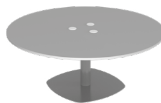
Mono Giant Table height 740 mm

3x Solo Power Units can be specified, see page 244 for more information. See drawing for table top position on Mono Giant.