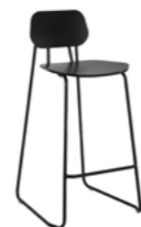
Swing Stool width 20, depth 21.5, height 38, seat height 28.5"