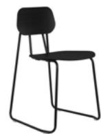
Swing Chair width 20, depth 20, height 30.5, seat height 18.5"