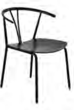
Wish Chair width 565, depth 570, height 765, seat height 440 mm