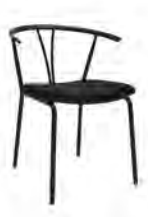
Wish Upholstered Chair width 565, depth 570, height 765, seat height 470 mm