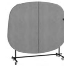
Home Mobile Media Wall width 60, depth 18.5, height 56.5, panel depth 2"