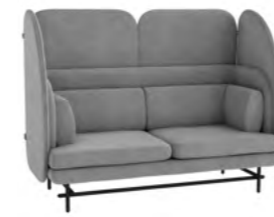
Home High Sofa Two Seater width 71.5, depth 32.5, height 56, seat height 17.5"

Monitors are not supplied by Frövi and a 28 inch screen size is recommended. Integrated cable management.