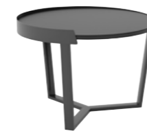
Margin Table High height 17.5, top thickness 0.5"