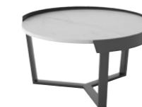
Margin Table Low height 14, top thickness 0.5"