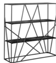
Foundry 120 Shelves