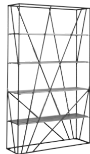
Foundry 200 Shelves