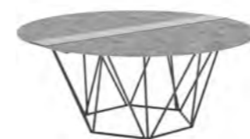
Foundry Giant Table height 29"