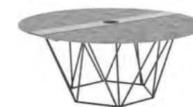
Foundry Giant Table with 1 Power height 29"