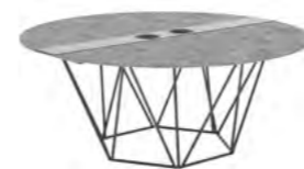
Foundry Giant Table with 2 Power height 29"