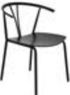
Wish Chair width 565, depth 570, height 765, seat height 440 mm