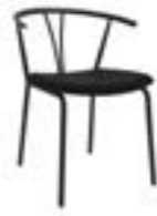
Wish Upholstered Chair width 565, depth 570, height 765, seat height 470 mm