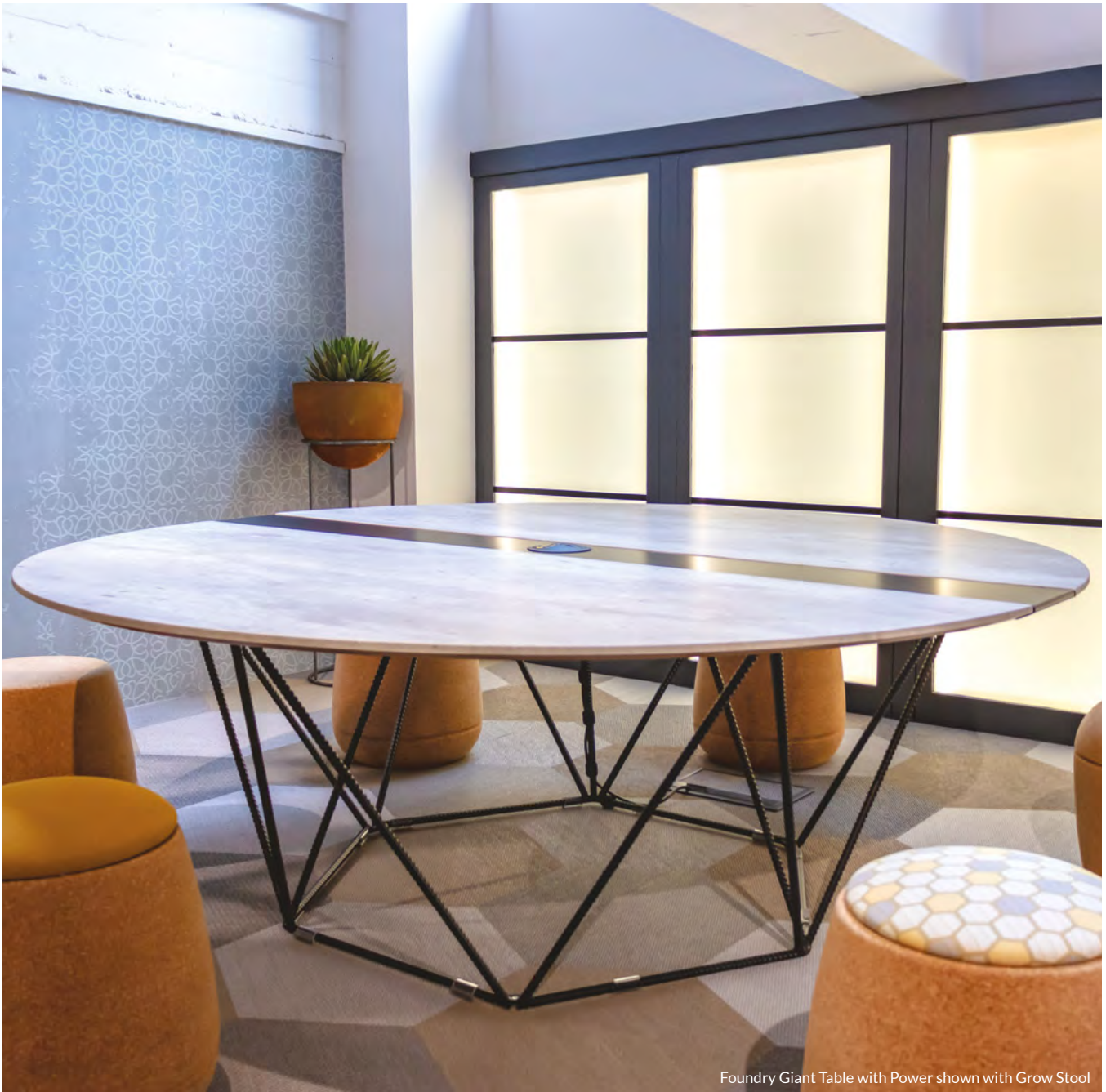
Foundry Giant Table with Power shown with Grow Stool