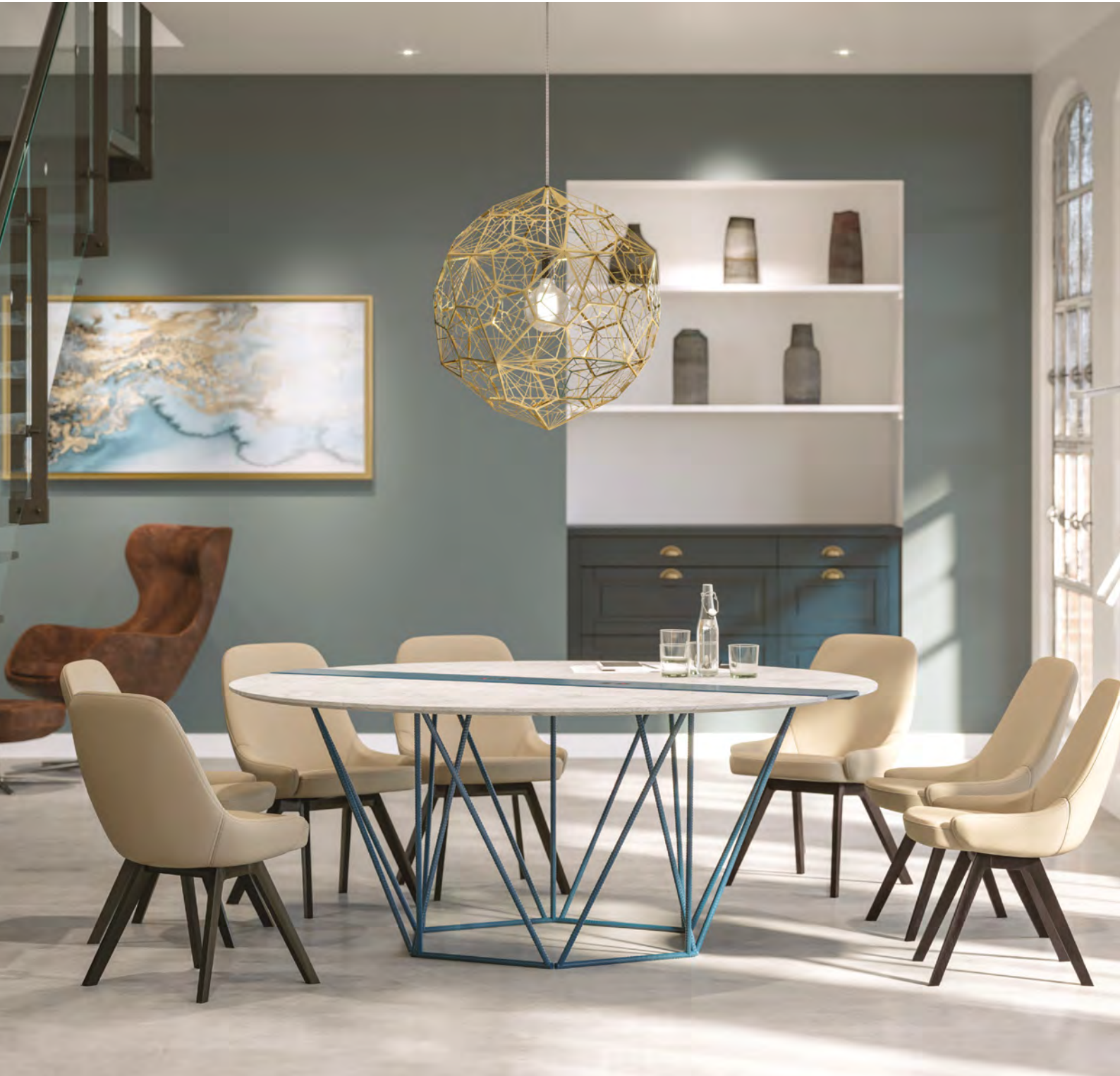
Foundry Giant Table with Power shown with Downtown

This stunning design is a combination of elegance and raw beauty – the unequalled resolution to collaboration requirements within an open plan office. Featuring a geometric rebar sculptural base, offered in a wide range of colors, this table makes a bold statement in any co-working space.