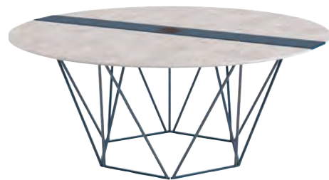
Foundry Giant Table with Power, Concrete top and Steel Blue central strip and frame