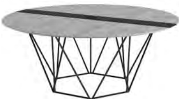
Foundry Giant Table with Power height 29.1"