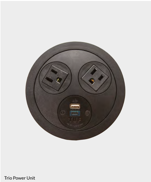
Trio Power Unit