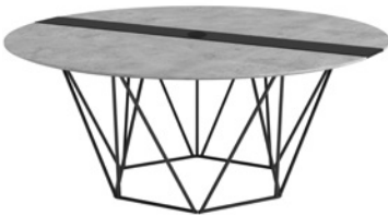
Foundry Giant Table with Power height 740 mm