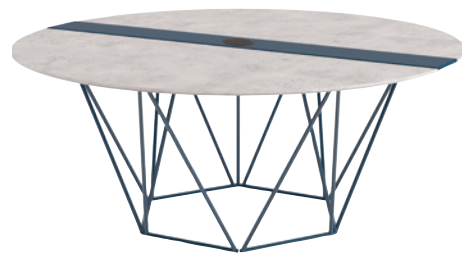
Foundry Giant Table with Power, Concrete top and Steel Blue central strip and frame