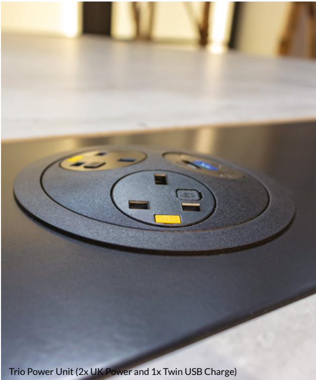
Trio Power Unit (2x UK Power and 1x Twin USB Charge)