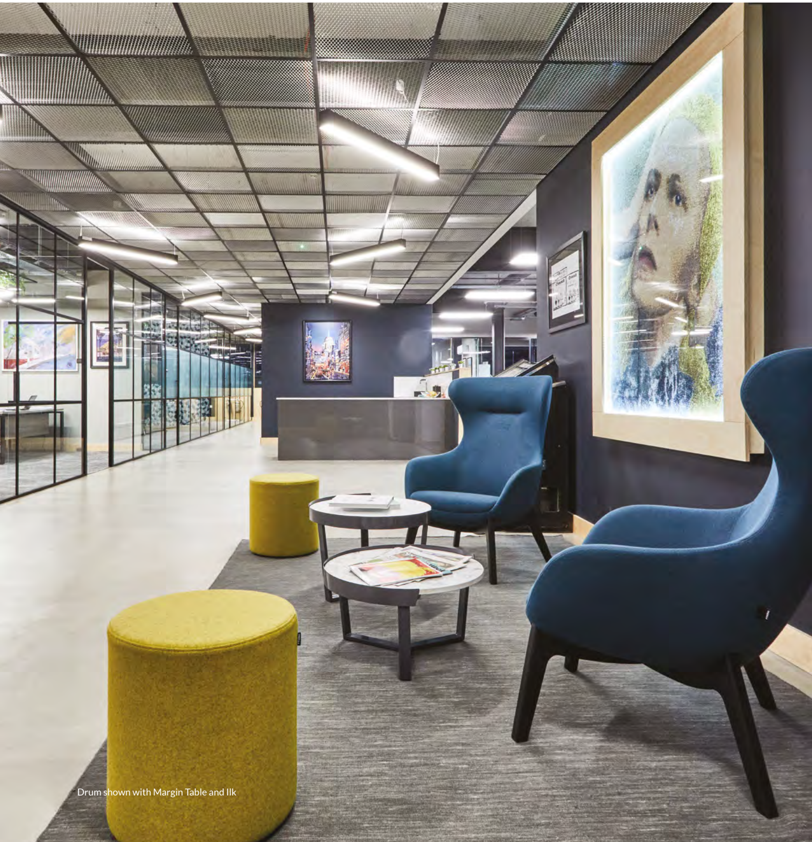
Drum shown with Margin Table and Ilk

This versatile fully upholstered stool is lightweight and manoeuvrable. A fun and practical seating solution enabling spontaneous meetings. Available with castors for added flexibility to move around the workplace. Drum can be used in every conceivable environment.