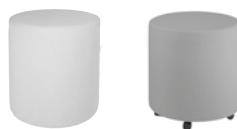
Drum diameter 420, height 460/480 mm